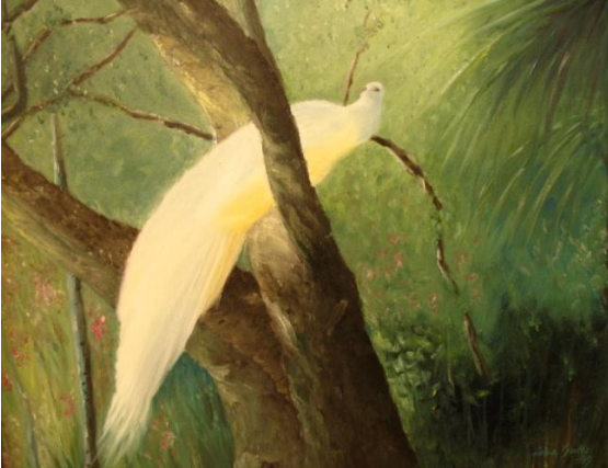
White peacock by Lena Gates